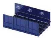
Extended Fixed [EF]