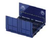
Standard Fixed [SF]