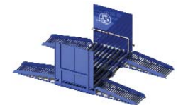
Mini Transportable [MT]