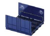
Standard Fixed [SF]