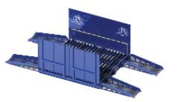
Standard Transportable [ST]