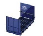
Mini Fixed [MF]