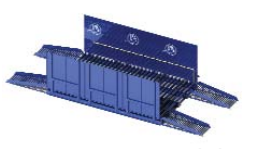
Extended Transportable [ET]