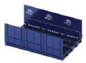
Extended Fixed [EF]